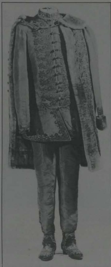
Hungarian man's suit, 1860-70, loaned by the Ethnographic Museum, Budapest, to the Whitworth Art Gallery for the exhibition from June 2-August 11

The costumes, lent by the Hungarian National Museum, the Museum of