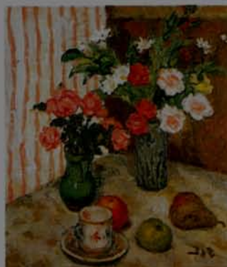
Georges d'Espagnat's still life at Connaught Brown

2 Albemarle St, W1 'Aspects of Post-Impressionism II'. 14 October-8 November. Mon-Fri 9.30-6, Sat 10-12.30.