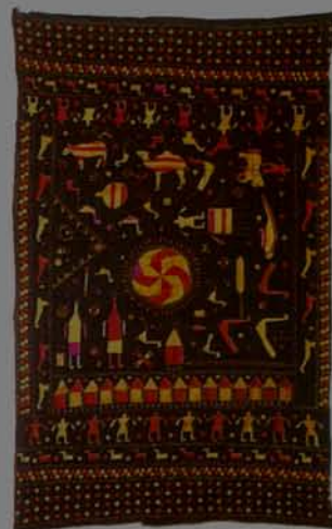
Phulkari from the Punjab at Joss Graham

10 Eccleston St, SW1 'India: textiles, woodwork, stone carving and jewellery'. 10-30 October. Mon-Fri 10-6, Sat 10-1.