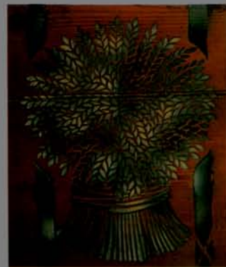
Lyn Le Grice stencil at Chelsea Crafts Fair

King's Rd, SW3 Chelsea Crafts Fair is a selling exhibition of work by more than 200 contemporary craftsmen: glass, ceramics, knitwear, tapestries, art clothes, toys,